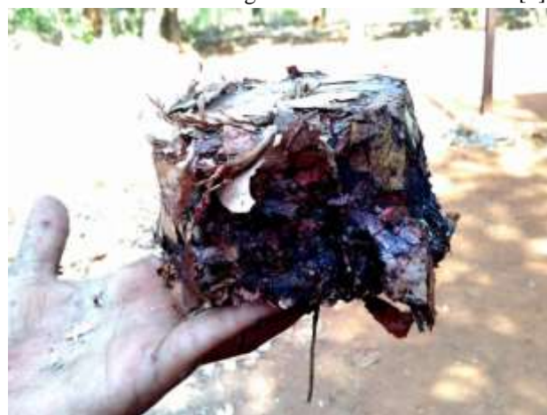
Fig. 2: Leaf Logs

For the performance evaluation, three briquette samples were made from the dry leaves for evaluation. During the process of densification, the following statistic: time for loading biomass into moulds, t_1 , sec, time for compressing the biomass, t_2 , sec, and time for ejecting the biomass briquettes, t_3 , sec, were observed and recorded following after [5][6]. The production capacity of the machine in kg/hr was also recorded. On ejection of the briquettes from the moulds, the mass and the dimensions of the briquettes were taken to determine the density in g/cm^3 . The compressed density (density immediately after compression) of the briquette was determined immediately after ejection from the moulds as the ratio of measured weight to the calculated volume [5].